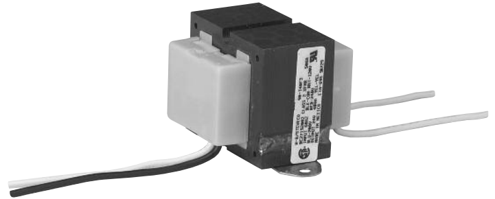
MODEL AMS080 Used in AMS070V controller