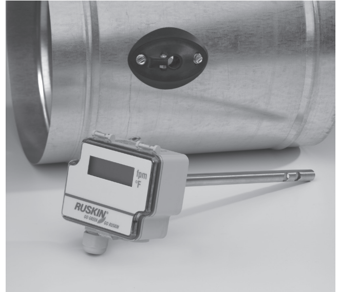
DART shown with dual durometer mounting flange mounted on a spiral duct (by others).