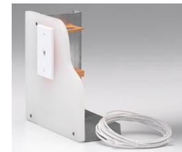
Installed junction box with power transfer cable