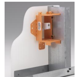
Installed junction box with wall box coupler and cover plate in place

Maintenance: When stored and installed correctly, Ruskin ZPD series dampers are maintenance free for the expected life of the damper. If the damper does not operate, replace the battery in the hand-held remote damper control.