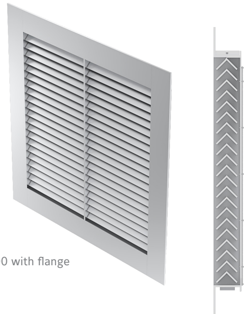
XP500 with flange