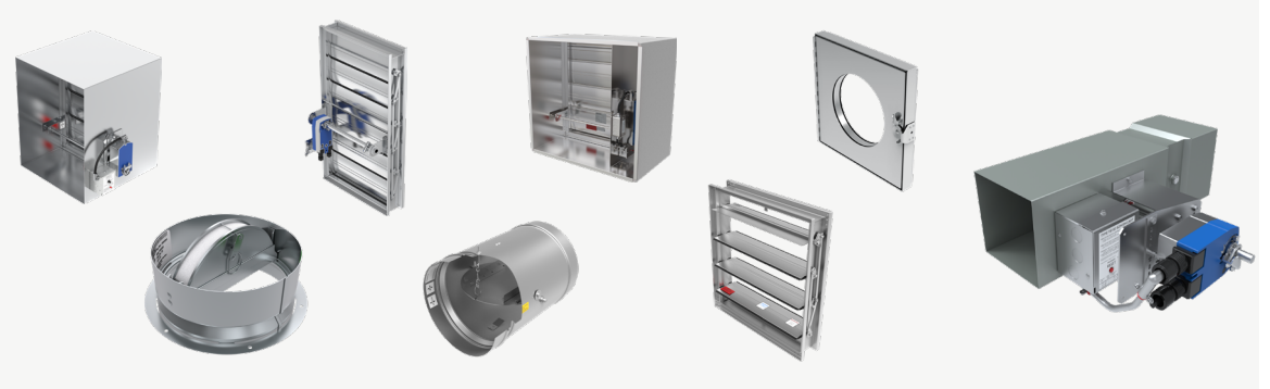
Ruskin® manufactures an extensive line of UL-rated and listed dampers to protect your life and property.