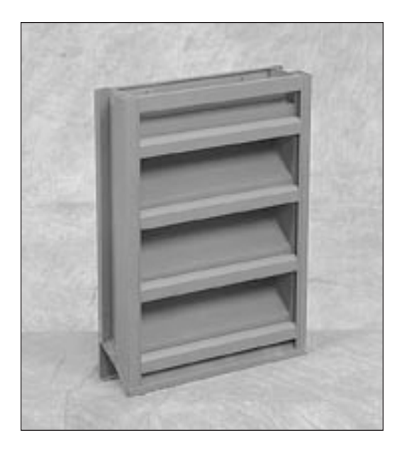
ELF375DX 4" Deep Standard Drainable Design