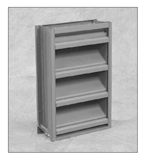
ELF6375DX 6" Deep Standard Drainable Design