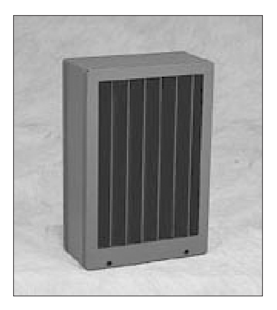
EME6625 6" Deep Wind Driven Rain Resistant Design

EME520DD 5" Deep Wind Driven Rain Resistant Design