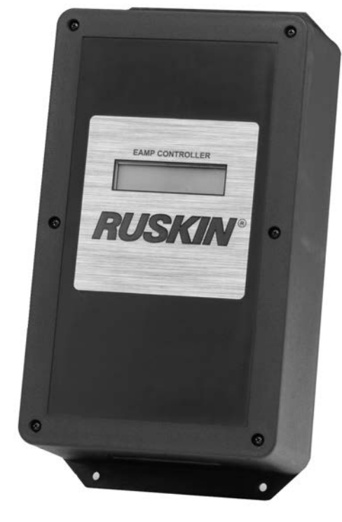
EAMP020 Control Transmitter